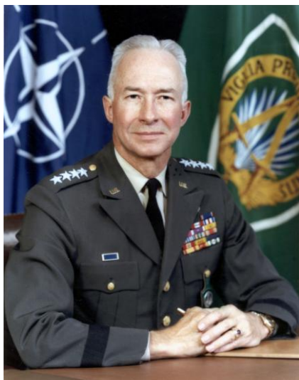
GEN Andrew J. Goodpaster