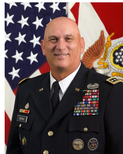
GEN Raymond T. Odierno